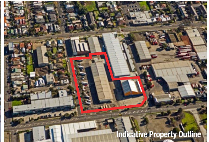
Indicative Property Outline