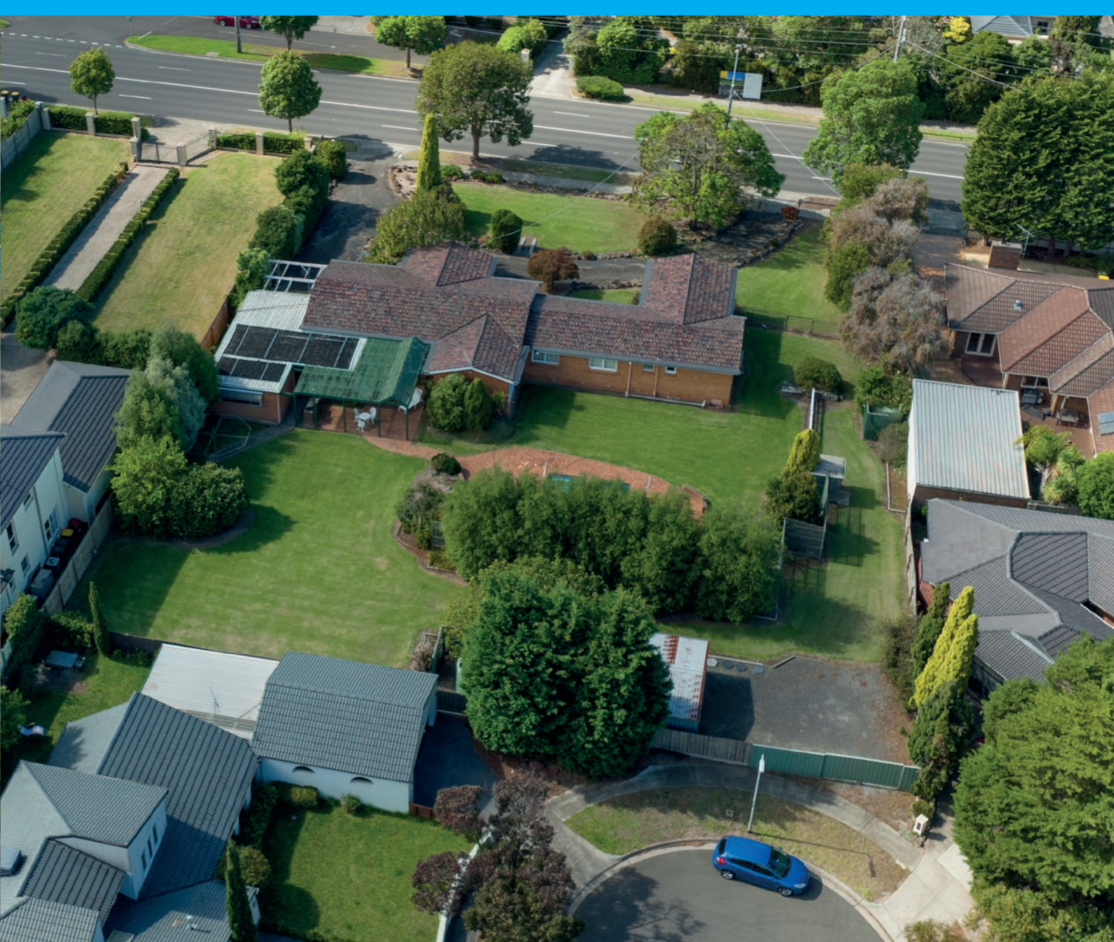
Indicative Property Outline